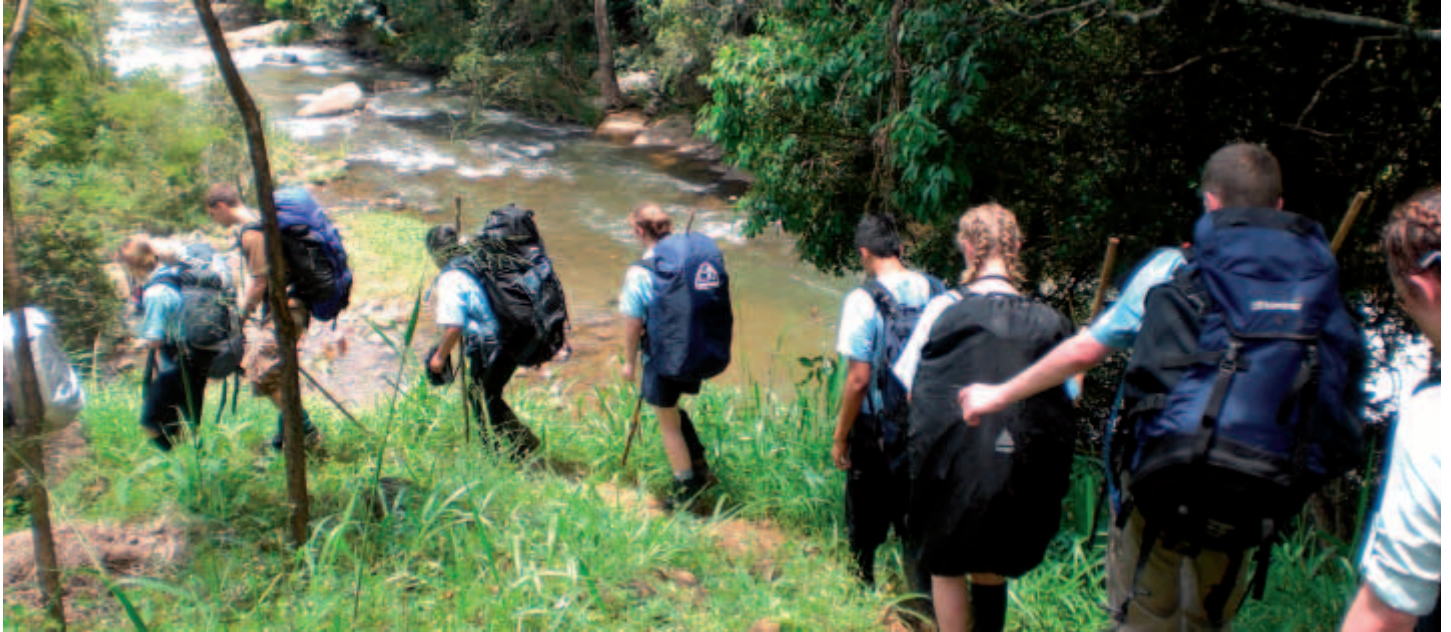
During the expedition

344 (Fulham) Squadron has become the first ever Air Cadet Squadron to visit the island of Sri Lanka. 15 cadets, supervised by 5 members of staff departed the UK on the 1st April 2008 for an adventure of a lifetime.