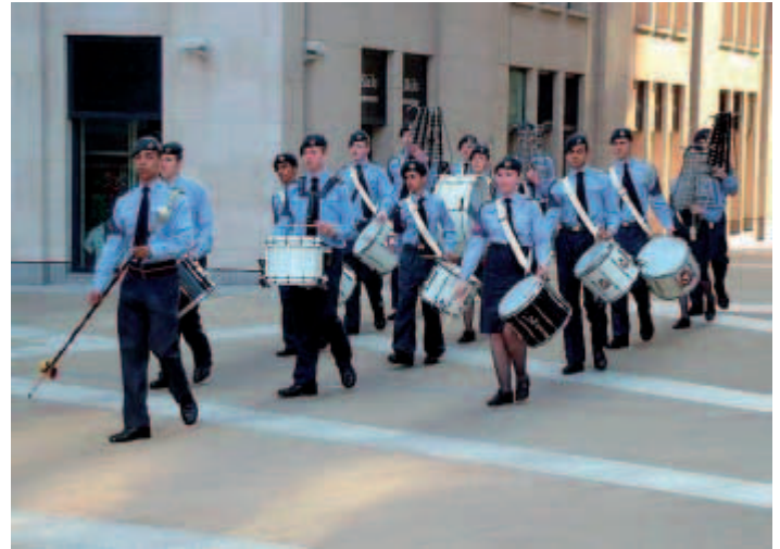
The band performing in Paternoster Square

The 444 Squadron band performed in Paternoster Square before the