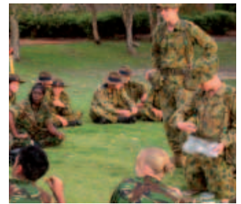
Preparing for their field craft exercise

On returning to Perth, the cadets finished off with a visit to HMAS Stirling, a naval base off the coast of Perth.