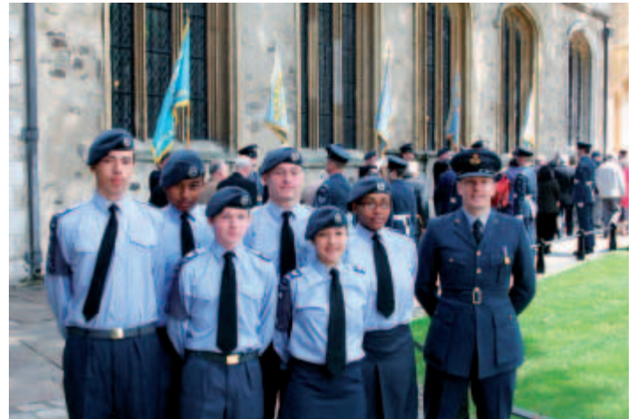
The Cadets at the Tower