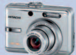
One of the prizes on offer!

More details are available from your Wing MCO