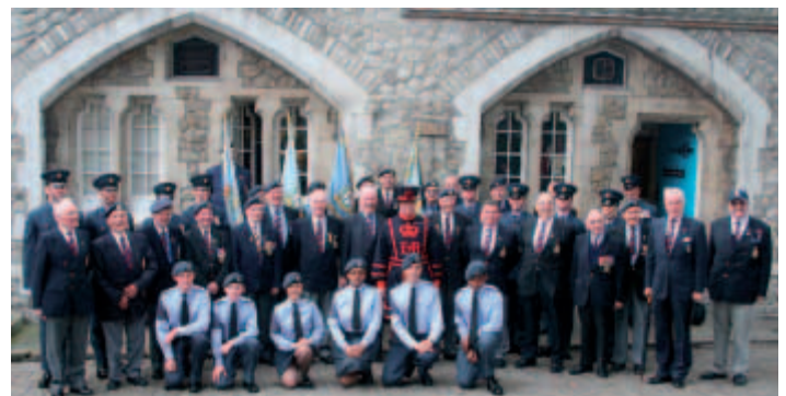
The Cadets, Tower Yeoman, member of the RAF Regiment and Veterans pose for a picture outside the Royal Chapel