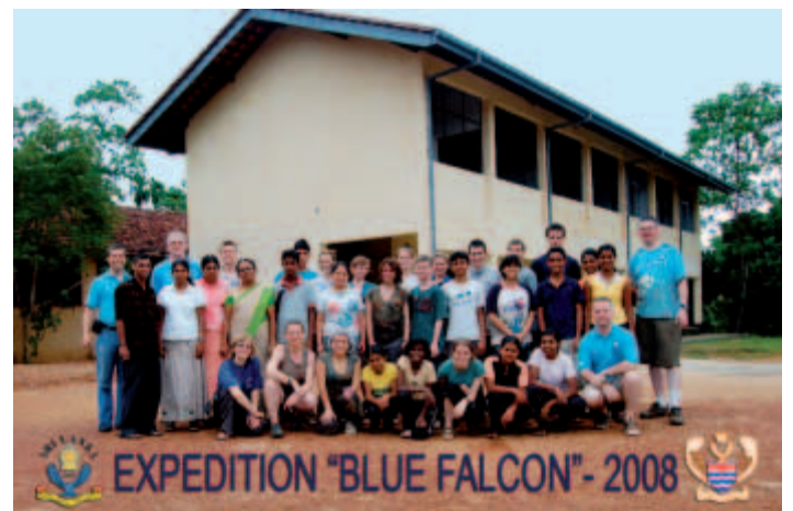
The group outside the school they assisted renovating