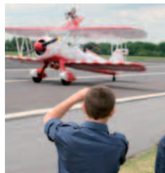
Enjoying some of the flying displays