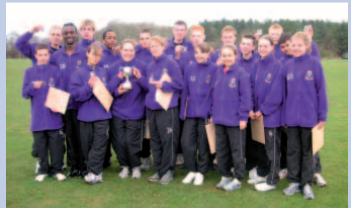
The Cross Country team

Old Record – 19.75m (2006) / New Record – 22.81m (2008)